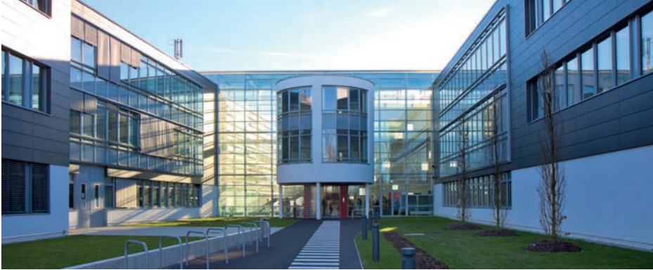
The newly launched annex at the institute building: The IHP carries out research and development on silicon-based systems, ultrahigh frequency circuits and technologies for wireless and broadband communication. The main research focus is placed on applications in telecommunication, semiconductors and automobile industry, aeronautics, telemedicine as well as automation technology.

On December 16 th 2013 the IHP - Innovations for High Performance Microelectronics celebrated with many guests from the politics, economy and the science sector three successful research decades. Among the guests was Brandenburg’s Prime Minister Dietmar Woidke, who dignified the IHP as a “High-tech flagship”. Wolf-Dieter