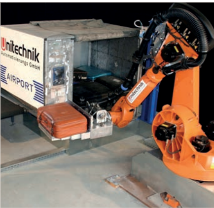
The patented gripper arm with the telescopic hand takes the luggage from the conveyor belt and places it in the container.

The Belgium company NPP NEW product-packlab started with the manufacturing of bio and recycling plastic products in Frankfurt (Oder). All in all, the company aims to invest more than € 8.5 million in highly-automated manufacturing technologies and an own company building. Therefore, the company already bought an industrial site directly at the highway A12 (E30). The principal customers for these mainly bio-based plastic products are catering companies from the tourism sector, industry and trade. Furthermore, NPP aims to score with new in-house developed food service concepts for hospitals and supermarkets.