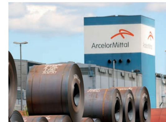
Over 60 years of experience in steel production: The plant in Eisenhüttenstadt is nowadays a modern high-tech integrated steel works.