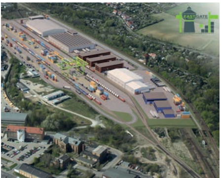
This is how it will look like in the future at the CT terminal in Frankfurt (Oder): Beside the construction of additional tracks and the installation of a cross-tracks crane runway, new areas for the settlement of rail-specific logistic companies are being developed.