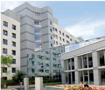
The hospital Frankfurter Klinikum celebrates its 30 th year of existence. With 1,200 employees it is one of the greatest employers in the region. In 2013 approximately 79,000 patients were treated.