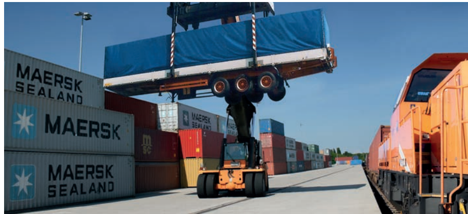
Punctual freight transports without toll charges and without traffic jams. Currently, more than 30 container trains operate in line traffic from and to the international seaports and the Polish economic centres. In the future, also craneable semi-trailers shall be handled here.

“Unipack” – the world’s first robot which can load baggage from a conveyor belt directly into a container, is now being tested by the British air carrier Easyjet in real operation at Berlin-Schönefeld airport. The fully automated system, which was jointly invented by Unitechnik Automatisierungs GmbH Eisenhüttenstadt, Projektlogistik GmbH Wildau and Richtsteig Anlagentechnik GmbH, firstly measures the dimensions of the luggage and then stores it with optimum space utilization in a transport box. With a successful test run in the airport, the innovative technology aims to find it’s way around the world. ① www.unitechnik-eh.de