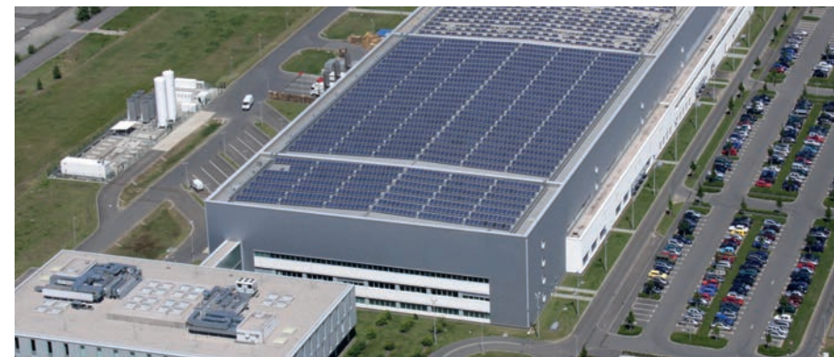
The highly efficient production lines at this site enable a cost-efficient production. The production costs in Frankfurt (Oder) are yet below the generally applicable solar module minimum price of 57 Cent per watt for imports from China.

Frankfurt (Oder) remains a solar manufacturing site. The company Astronergy Solar-module GmbH, which belongs to the Chinese Chint-Group, took over the module manufacturing plant of the insolvent German Conergy AG in December 2013. In the future, the site in Frankfurt (Oder) shall be the central European base for production and sales of the company's photovoltaic products. Currently, three of five module lines are running, employing a staff of 200 workers. In the course of the year, the manufacturing will be expended with at least one line. "Quality and safety always play a major role upon long-term investments. „The step