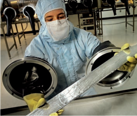
5N Plus produces and recycles in its German subsidiary 5N PV in Eisenhüttenstadt specialty metal and chemical products such as Cadmium Telluride or Zinc Telluride for the electronics and photovoltaics industry.

The Canadian company 5N Plus Inc. received the “Deloitte Technology Fast 50” award for a fourth consecutive year. Thank’s to it’s high potential for innovation, it’s ongoing investments in R&D and it’s amazing increase in revenues, the company ranked 5 th among the fastest growing technology companies in Canada. ① www.5nplus.com